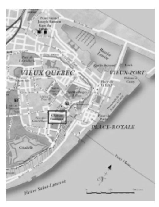
Map of Old Quebec, site of the 30th Annual ASP meeting (July 13-17). The meeting site, Fairmont Le Château Frontenac, is enclosed in a box.

The Council will take up proposals at its two sessions during the annual meeting, and welcomes discussions of these and other ideas at the annual business meeting. The Council actively discusses issues by e-mail in the time leading up to the annual meeting. If members have ideas for the Council, they may e-mail them to the Secretariat, at asp@courtesyassoc.com, for circulation to the Council. Participation in strategic planning is a good way to begin your involvement in ASP governance.