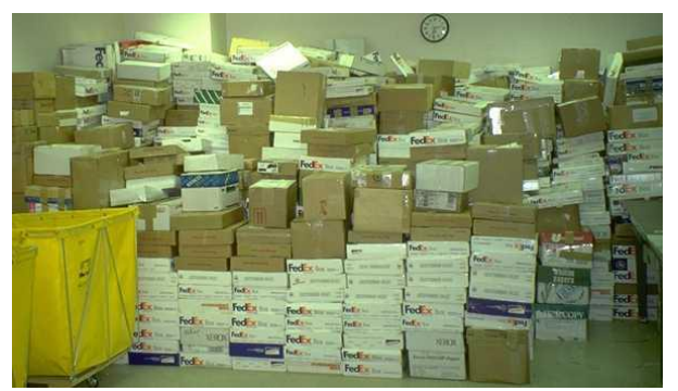
Figure 1: NIH loading dock on the day grant applications were due in 2001 prior to electronic submission.

When I first begin submitting those traditional R-01 investigator-initiated grant proposals, it was all done on paper. Multiple copies needed to be submitted and there were periodic images sent around of fork-lifts moving huge piles of paper in some NIH facility (Figure 1). The results of the review process would eventually be returned on pink paper (the infamous 'pink sheets') and one had to really come up with something preposterous to get a bad score). Anything with a reasonable chance of success was considered worth at least one funding interval. So the move from graduate student to post-doc to assistant professor was not a 'big deal'. The general rule was that sometime with ideas ought to be able to make the transition from new PhD to Professor with tenure in about 15 years.