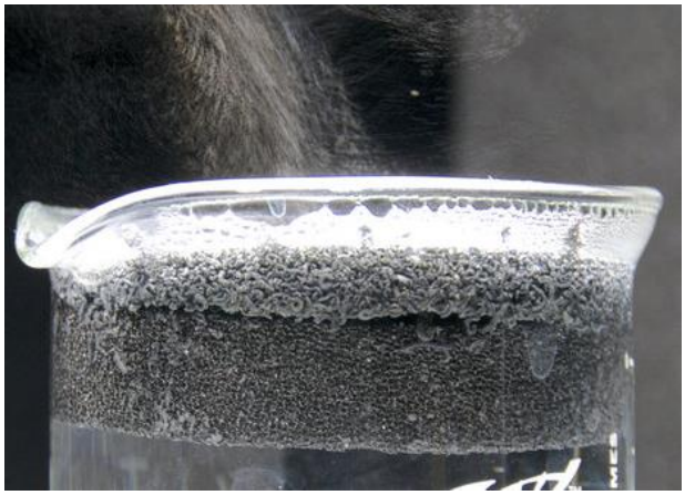
Solar sponge: The top layer of graphite soaks up the sun's energy in tiny holes. When drops of liquid fill the holes, the water quickly evaporates. (The beaker looks hot, but the water below the sponge is cool).

The trick to creating these "hot spots" is having the right material, he says. And that's where the graphite in pencils comes into play.