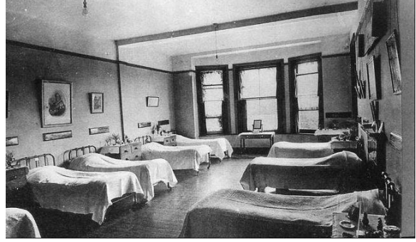
Accommodations for student participants

The level of conference accommodations can range from the magnificent Del Coronado Hotel in San Diego to the Detroit Plaza (currently undergoing repairs). There are often opportunities for students and impoverished post-docs to stay in quasi-dormitory accommodations while the Profs and conference organizers can opt for better (often spectacular) possibilities.