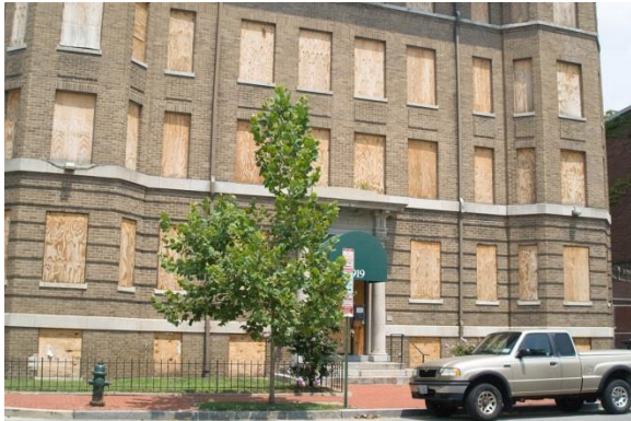
Detroit Plaza, undergoing repairs

Other cities now routinely host scientific meetings, ranging from the mammoth (AACR, AMA, ACS, SPIE) to the minuscule, e.g., ASP. The mega-meetings can be accommodated in only a few places with the monster convention centers, but smaller meetings can spring up almost anywhere. For the MDs, there is an annual magazine showing all of the assorted venues for conferences, along with the proximity of golf courses, fine restaurants, investment counselors, beaches and ski lifts. For the scientists, it's usually a matter of checking out 'Trip Advisor' or Frommer while keeping a careful eye on the budget.