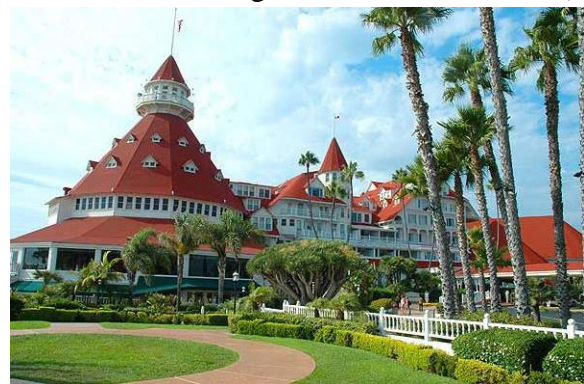
Del Coronado, San Diego

The sight of 20,000 scientists prowling the Boardwalk was something to behold, each bearing a collection of heavy and fragile 3x4 glass slides showing images representing scientific progress. These slides were projected with arc lamps and the unhappy speaker who used heat-sensitive materials was often treated to the sight of his image slowly moving toward the top of the screen as melting proceeded. Later came 2x2 slides (much lighter but easily bent) and finally PowerPoint (can be modified while the talk is being introduced).