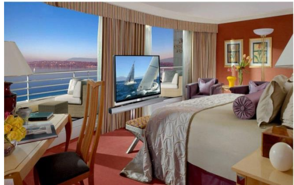
Accommodations for organizers or professors

Among the places that tend to attract meetings and participants are Boston, Quebec, Montreal, Vancouver, Seattle, San Francisco, San Diego, New Orleans, Washington DC and New York. It will be noticed that these are on the periphery of the US and generally are of sufficient interest that the existence of the meeting may be mainly a pretext for being there. The Gordon Conferences tend to be mainly located in very elegant Junior Colleges in New England. Some of these places appear to otherwise serve as parking places for problem children, with their faculties filled with such ranks as 'Professor of English and Discipline', 'Instructor in German and