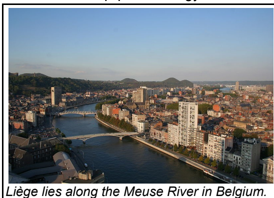
Liège lies along the Meuse River in Belgium.

ESP 2013 Liège (Belgium) Web site: www.esp-photobiology.it