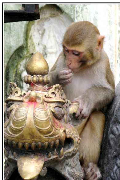
A Rhesus Macaque ( Macaca mulatta ) on Swayambhunath (also known as the "Monkey Temple"), Kathmandu Valley, Nepal.

sulcus and elicit changes in eye movement. They also used optogenetics simultaneously with fMRI to record changes in neural activity in the monkey brain.