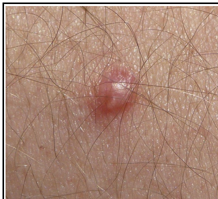
Wart caused by infection from a cutaneous HPV (from George Chernilevsky).

This research examined cutaneous HPVs, not the mucosal types that can cause cervical cancer. The five genera of cutaneous HPV were alpha, beta, gamma, mu, and nu. The study examined 173 patients with SCC (cases) and 300 patients without SCC (controls).