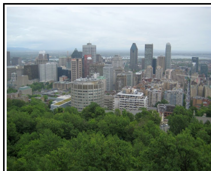
Montreal from Mont Royal