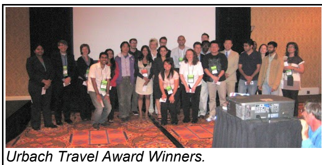
Urbach Travel Award Winners.