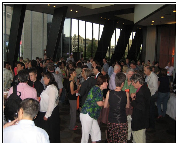
Welcome reception at ASP-2012